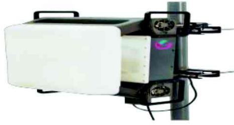
GigaMesh TAC LAN Radio