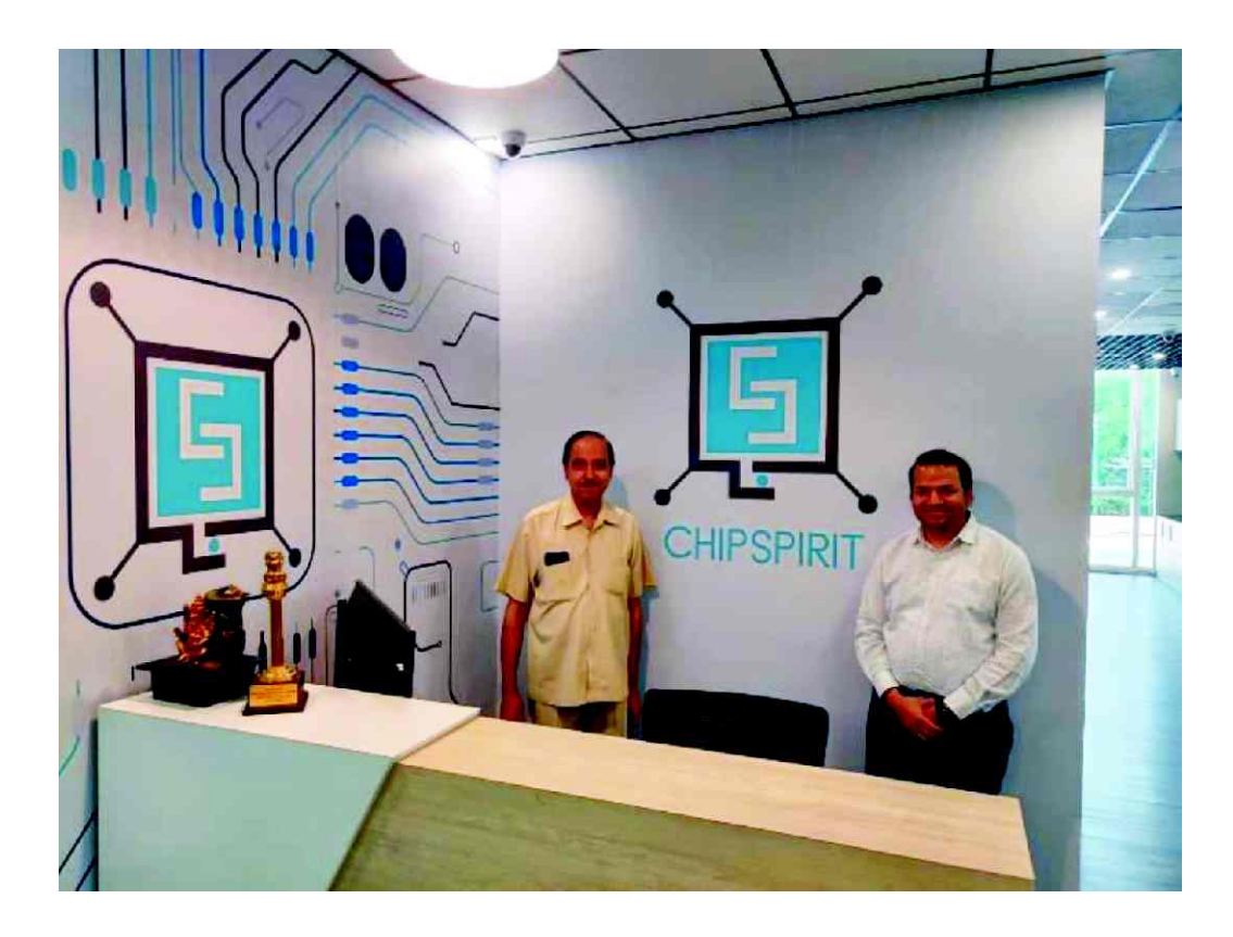
Award given by Home Minister to ChipSpirit is on left side bottom of picture.