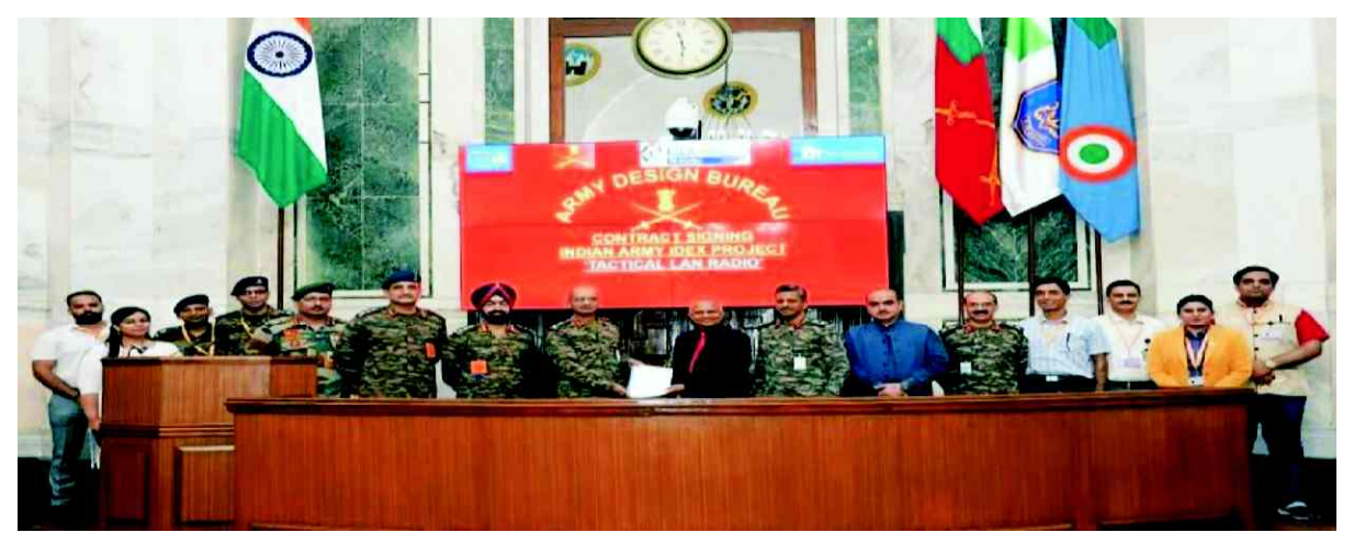
Signed on 6th June 2023

10.8 kilometers between two devices. Astrome's accomplishments have earned widespread recognition in the defense sector. as Astrome was shortlisted among the 14 companies selected by the esteemed Defense Acquisition Council (DAC) in 2022, solidifying its position as a trusted partner for the defense ministry.